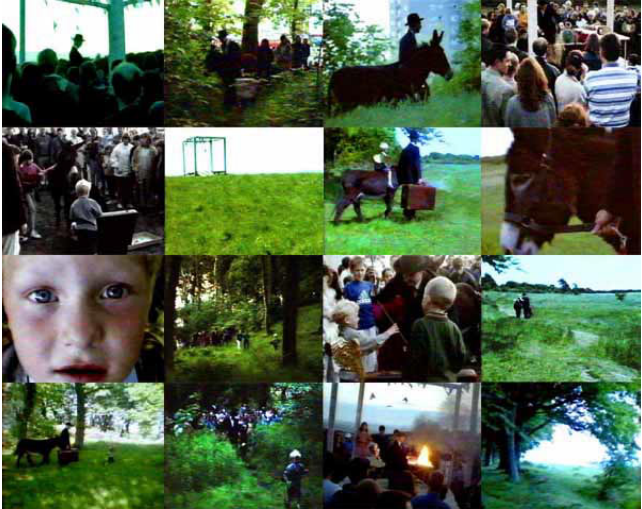
MONTAGE (1999), Foundry Collection , 150 x 120 cm Digital montage of frame captures from 16mm documentation, Hill (1995) Exhibited at Clerkenwell Literary Festival 1999, Tardis, London EC1 and New Foundry, London EC2.

Installation and performance views of Hill (1995); GENETIC WAKE Project (6) Site-specific art performance staged through Black Wood and Cathkin Braes on Glasgow City Limits. Castlemilk, Glasgow, June 1995.